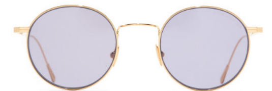
AUSN-0001-48-03 Gold 18K