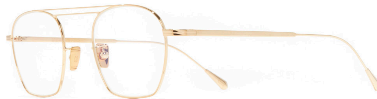
AUOP-0004-48-03 Gold 18K