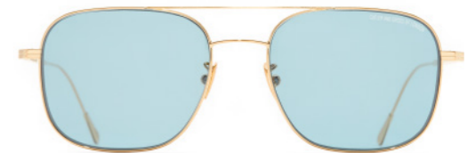
AUSN-0003-54-03 Gold 18K