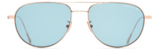
AUSN-0002-56-02 Rose Gold 18K