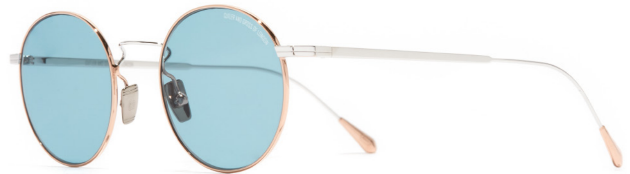
AUSN-0001-48-04 Rose Gold 18K + Rhodium 18K