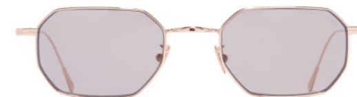
AUSN-0005-50-02 Rose Gold 18K