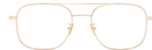
AUOP-0003-52-03 Gold 18K