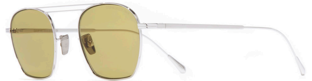
AUSN-0004-48-01 White Gold Rhodium 18K