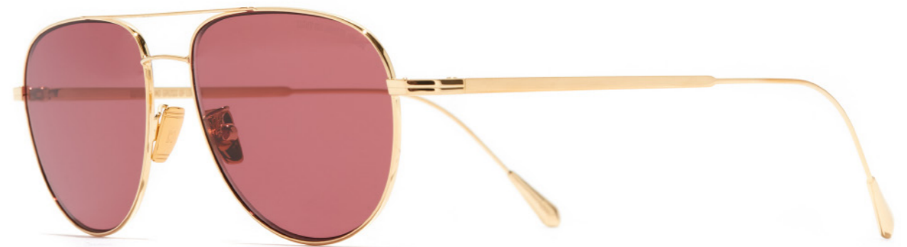
AUSN-0002-56-03 Gold 18K