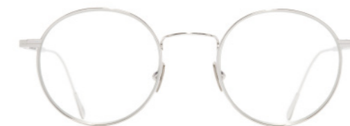
AUOP-0001-48-01 White Gold Rhodium 18K

Available plated in either 18K White Gold Rhodium, 18K Gold, 18K Rose Gold, or a combination of precious metals Rose Gold 18K + Rhodium 18K.