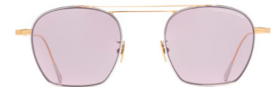
AUSN-0004-48-04 Yellow Gold 24K + Rhodium 18K