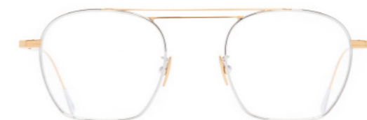
AUOP-0004-48-04 Yellow Gold 24K + Rhodium 18K