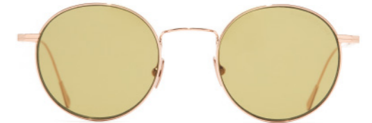
AUSN-0001-48-02 Rose Gold 18K