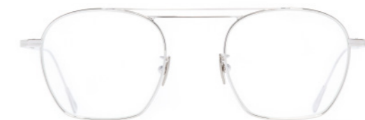
AUOP-0004-48-01 White Gold Rhodium 18K

Muted ZEISS solid Sunlens colourways of Khaki Green, Light Blue, Sand, and Light Pink complement each of the precious metal tones.