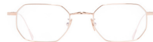
AUOP-0005-50-02 Rose Gold 18K