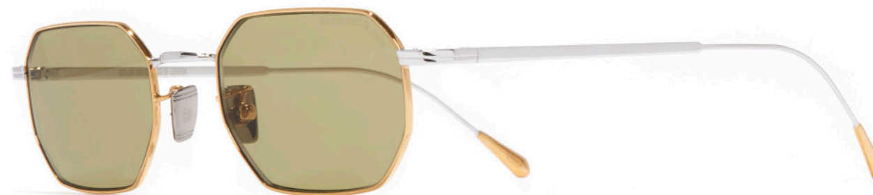
AUSN-0005-50-04 Yellow Gold 24K + Rhodium 18K