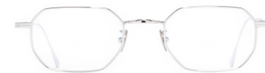
AUOP-0005-50-01 White Gold Rhodium 18K

Each style is paired with solid-coloured ZEISS Sunlens of solid colours, Light Brown, Light Grey, Blue, and Khaki Green.