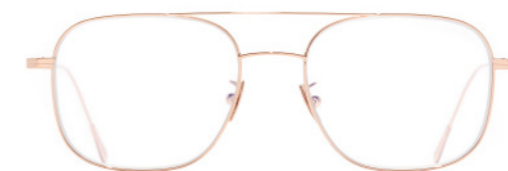
AUOP-0003-52-02 Rose Gold 18K

Featherlight in its construction, the flatline temple provides a slimline silhouette without compromising on visual impact and the fully adjustable nose pads add long-wearing comfort.