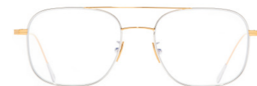
AUOP-0003-52-04 Yellow Gold 24K + Rhodium 18K