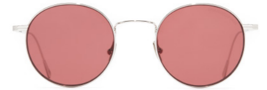
AUSN-0001-48-01 White Gold Rhodium 18K

Retro sun lens colourways are muted and subtle as not to detract from the natural lustre of the precious metal plating.