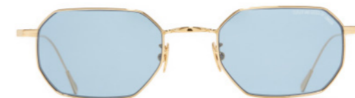
AUSN-0005-50-03 Gold 18K