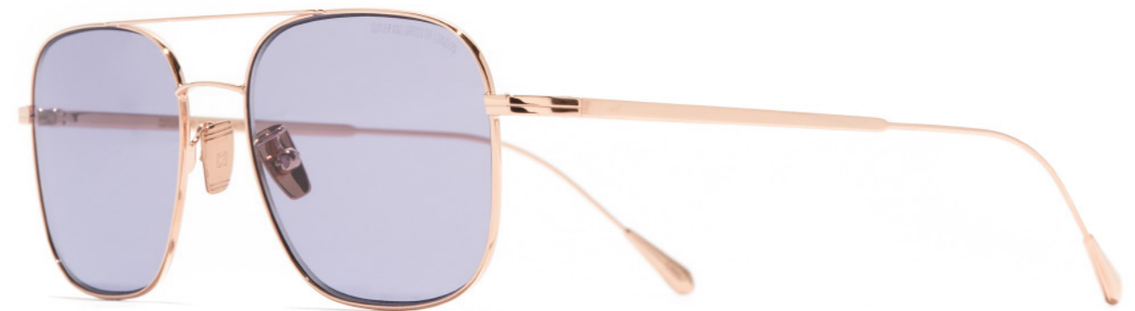
AUSN-0003-54-02 Rose Gold 18K