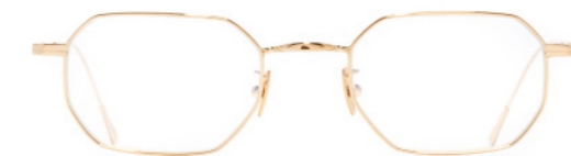
AUOP-0005-50-03 Gold 18K