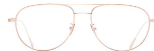
AUOP-0002-56-04 Yellow Gold 24K + Rhodium 18K