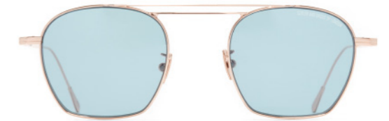
AUSN-0004-48-02 Rose Gold 18K

Muted ZEISS solid Sunlens colourways of Khaki Green, Light Blue, Sand, and Light Pink complement each of the precious metal tones.