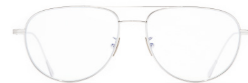
AUOP-0002-56-01 White Gold Rhodium 18K

An elevated version of our staple 1099, first launched in 2010, this frame offers visual impact paired with lightness and functionality.