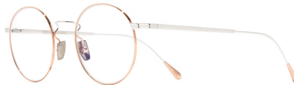
AUOP-0001-48-04 Rose Gold 18K + Rhodium 18K