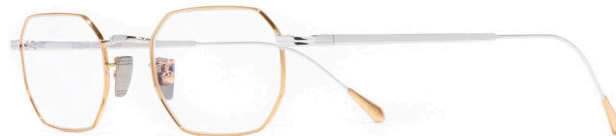
AUOP-0005-50-04 Yellow Gold 24K + Rhodium 18K