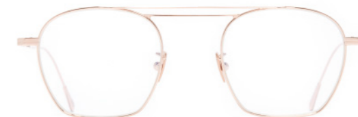
AUOP-0004-48-02 Rose Gold 18K