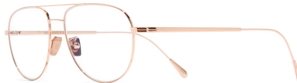
AUOP-0002-56-02 Rose Gold 18K