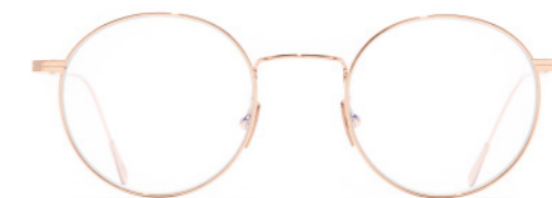
AUOP-0001-48-02 Rose Gold 18K