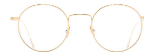
AUOP-0001-48-03 Gold 18K