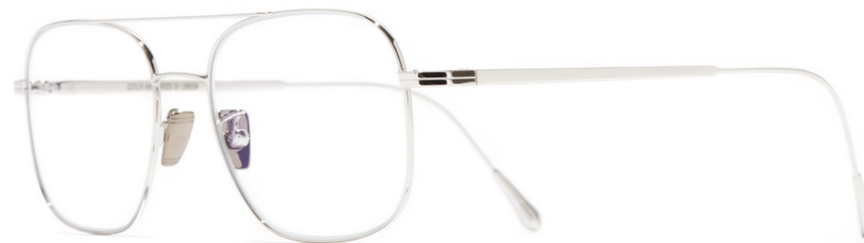
AUOP-0003-52-01 White Gold Rhodium 18K