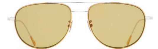
AUSN-0002-56-04 Yellow Gold 24K + Rhodium 18K