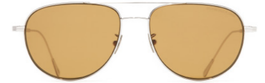
AUSN-0002-56-01 White Gold Rhodium 18K

Crafted from Swiss alloy stainless steel plated in either 18K White Gold Rhodium, 18K Gold, 18K Rose Gold, or a combination of precious metals Yellow Gold 24K + Rhodium 18K.