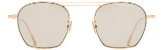
AUSN-0004-48-03 Gold 18K