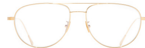
AUOP-0002-56-03 Gold 18K