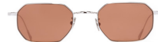
AUSN-0005-50-01 White Gold Rhodium 18K

Each style is paired with solid-coloured ZEISS Sunlens of solid colours, Light Brown, Light Grey, Blue, and Khaki Green.