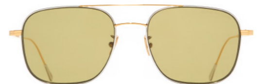
AUSN-0003-54-04 Yellow Gold 24K + Rhodium 18K